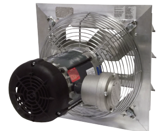
EXPLOSION PROOF MOTOR