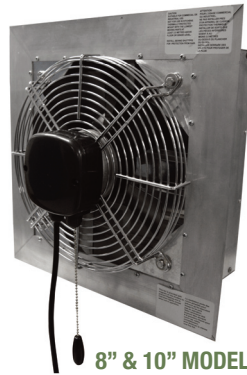
8" & 10" MODEL

The AX series exhaust fan is a sturdily constructed, direct drive, horizontal discharge fan that is typically used for general ventilation of factories, garages, warehouses and other industrial or commercial buildings. The AX fans are available in multiple single-speed variations as well as two-speed and variable speed models. The AX series housings are constructed of heavy duty aluminum with built in shutters that automatically open when the fan starts and gravity closes when the fan stops.