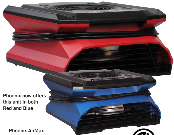
Phoenix now offers this unit in both Red and Blue

The Phoenix AirMax is the safest fan in its class providing a quality GFCI convenience receptacle that protects not only connected loads, but onboard components as well. This is unlike competing fans that require external GFCI protection. In addition, where competitors position high voltage electrical connections low to the floor, the leading edge design of the Phoenix AirMax allows these connections to be located more than 4 times the minimum required height. The Phoenix AirMax is built to keep our customers, and their customers, safe.